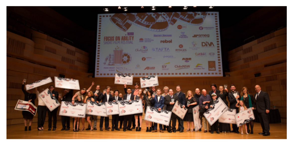
Concourse Concert Hall, many of whom had been involved in the making of one of the films, either on camera or off.

As well as the awards night, this year NOVA also hosted a Schools Screening for the first time. Approximately 400 people attended the event at Chatwood's